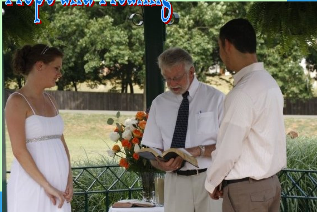
Volunteer Marriage Counselor officiates a Wedding Ceremony - United in Love